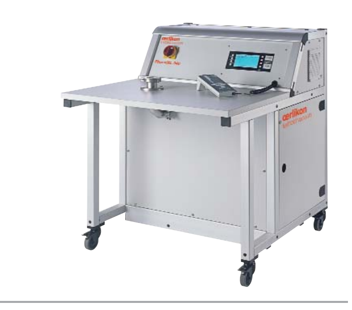
Customised PHOENIXL 340 for parts testing in series production