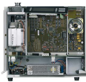
Internal design - clear and maintenance-friendly