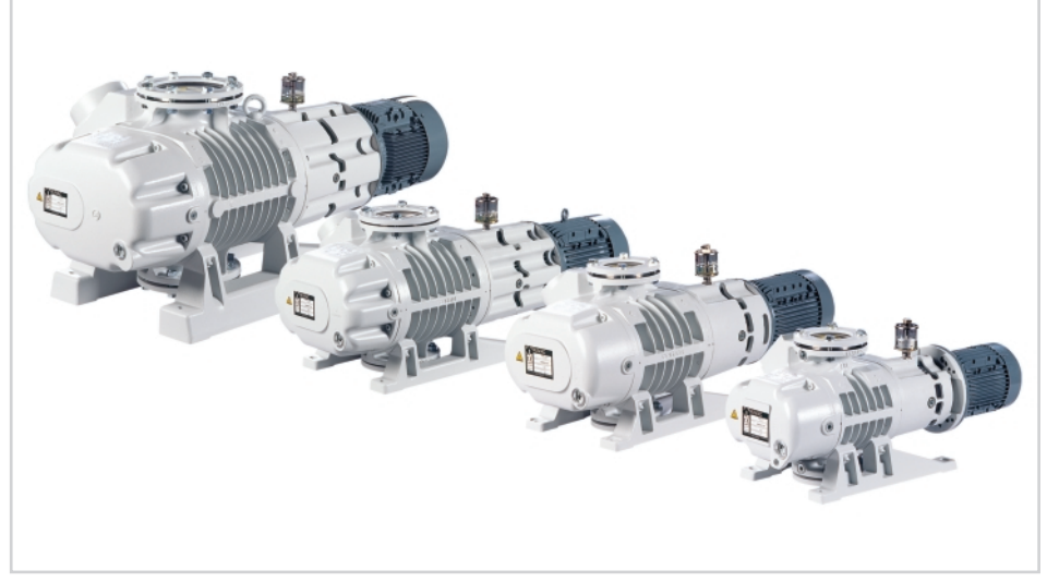
Range of RUVAC WAU pumps: WAU 2001, WAU 1001, WAU 501, WAU 251