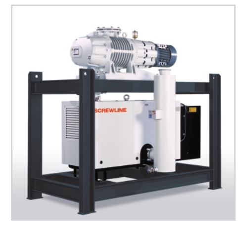
Vacuum pump system RUTA WAU 2001/SP 630/G for industrial applications, consisting of RUVAC WAU 2001 and SCREWLINE SP 630

RUVAC roots pumps are used in almost all areas of vacuum technology. They are a standard in combination with the established oil-sealed TRIVAC and SOGEVAC families. But they are also a standard as a complete dry combination with the SCREWLINE<sup>®</sup> family.